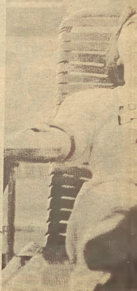
A FAITHFUL DONOR GIVES SO... BLOOD DRIVE ON CAMPUS. T... TICIPATED.