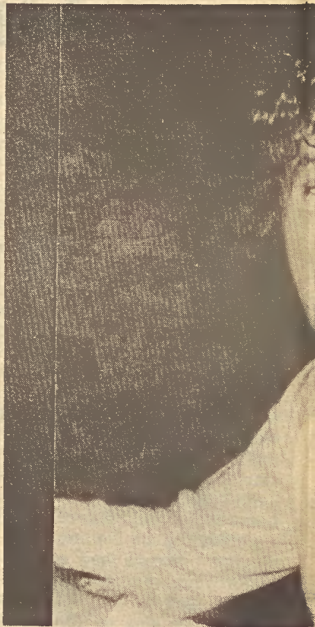
PARENTS WEEKEND WAS... WHOSE PARENTS COULD N... COUNSELOR 3RD FLOOR DA...