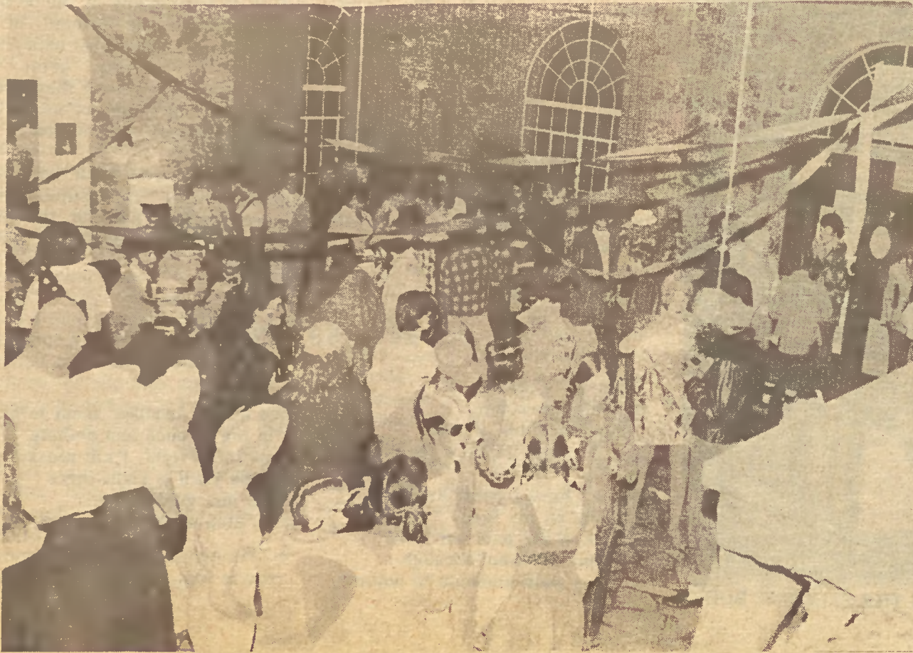
A HALLOWEEN MASQUERADE PARTY WAS HELD IN MCGREGOR DORMITORY LOBBY TO CELEBRATE (you guessed it) - HALLOWEEN!