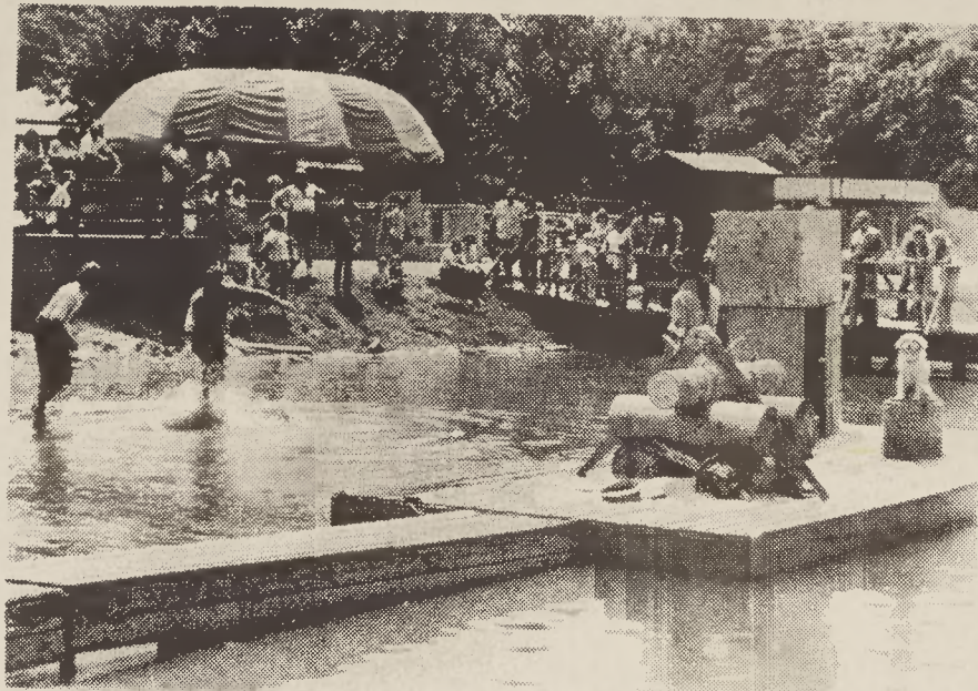
LOG ROLLING CONTEST on Frontier Lake provide fun-filled entertainment for people of all ages. It's just one of over 50 attractions at Frontier Land in Cherokee, N.C.