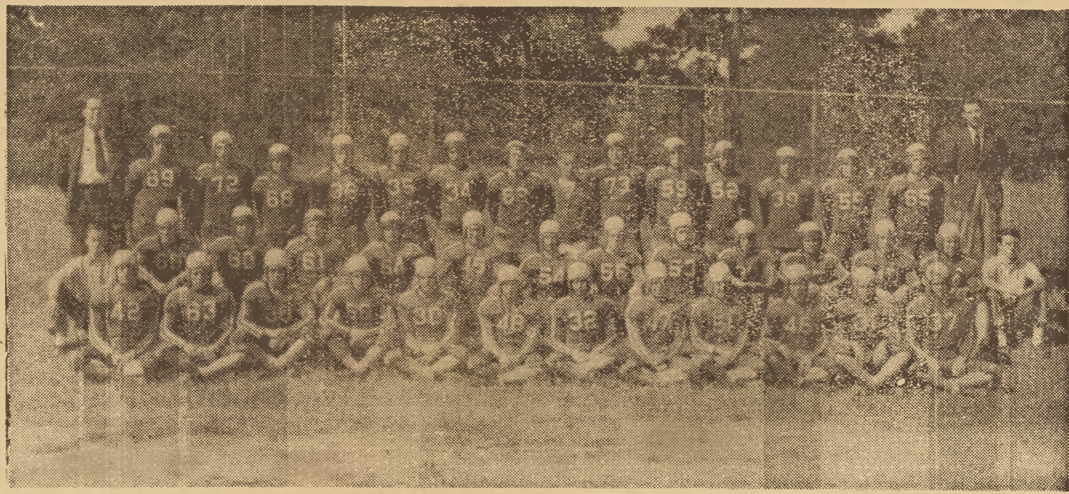
The husky group of lads you see above are the members of the Black Bison Varsity aggregation that invade Salisbury for their first Western Class A Conference combat this fall Thursday night, October 24 at 8 P. M.