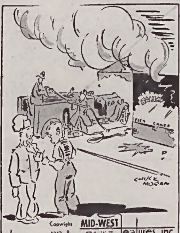
"Flaming Plum Puddin'! Bah!"

All School Supplies CECIL'S OFFICE EQUIPMENT CO. 304 South Main St. Phone 2929