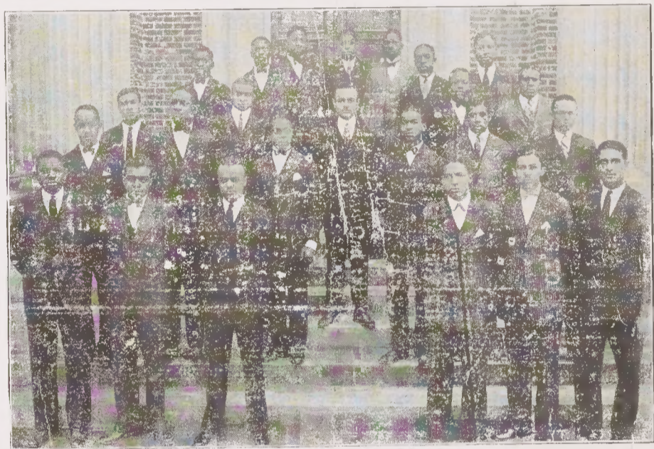
Alpha Omicron Chapter of the Alpha Phi Alpha Fraternity at Johnson C. Smith University.

The Assistant Smooth Sheba suggested that the Club adopt the slogan, "Catch