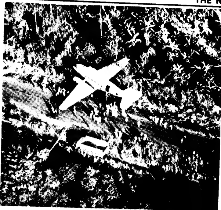
UNSCHEDULED STOP . . . This Douglas DC-3 of the Ecuadorean Air Force was forced into an emergency landing along a jungle road after its engines failed. Nobody was hurt in the crash landing.