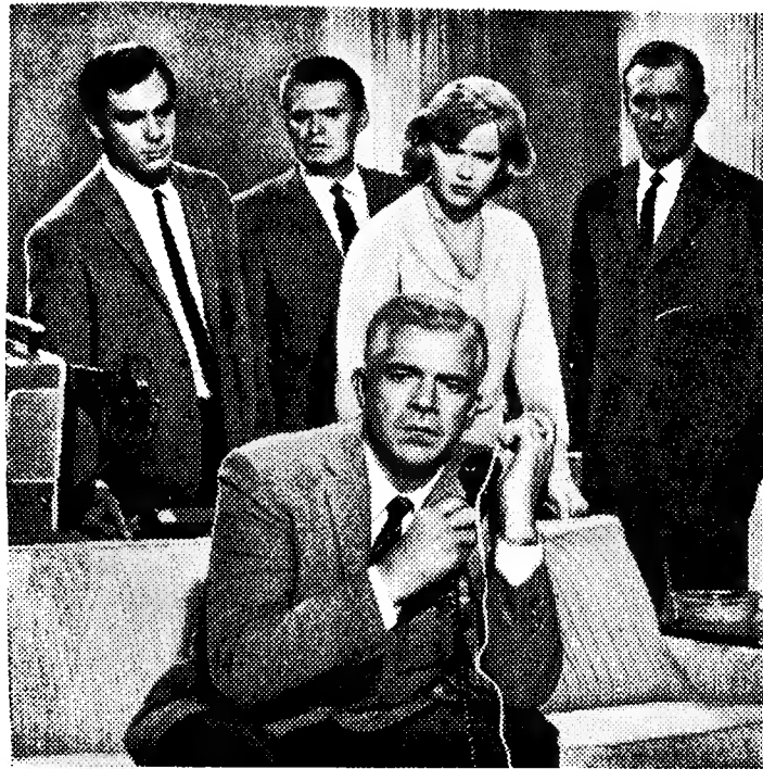
Dana Andrews is an important federal investigator and Anne Francis as his daughter, hear of a plot to destroy Los Angeles by virus in this taut scene from Mirisch Corporation's tense "The Satan Bug," DeLuxe Color-Panavision United Artists release now at the Tryon Theatre. John Sturges directed and produced.