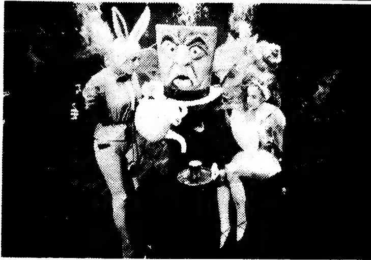
WONDERLAND . . . Each year at Weeki Wachee, Fla., mermaids stage an entirely new show in the depths of Florida's Under water Grand Canyon. Here they are shown portraying characters of their 1965 underwater show, "Alice in Wonderland."

Everywhere this spirit of nature is at work. Galaxies are