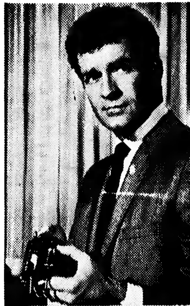
Hugh O'Brian co-stars with Barbara Rush in "Strategy of Terror" at the Masonic Theatre Sunday through Tuesday. Excitement reigns, as a plot unfolds that could forever change the world.

There isn't much to be seen in a small town, but what you hear makes up for it.... People wouldn't get divorced for such trivial reasons if they hadn't gotten married for such trivial reasons....These trying times are the good old