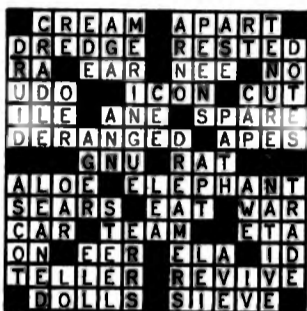
Answer to puzzle 12/24/79

Three oldtime remedies should be banned from your house. They are oil of wintergreen liniment, camphorated oil and boric acid solutions. None is of much value, but they're all poisonous if a child accidentally drinks some.