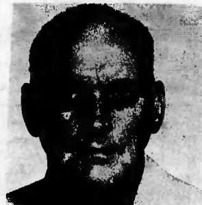
Paid for by Candidate

New Bern - Craven County Board of Education District 4, Seat 1