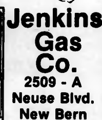
Proven LP-Gas Service