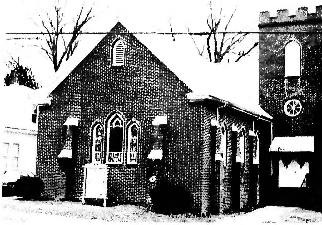
Site of Methodist Cantata

They have been about 1,000 letters sent to the private sector requesting donations. Those who did not receive a letter and wish to contribute should address contributions to Swiss Bear, 417-A Tryon Palace Drive, New Bern, N.C. 28560.