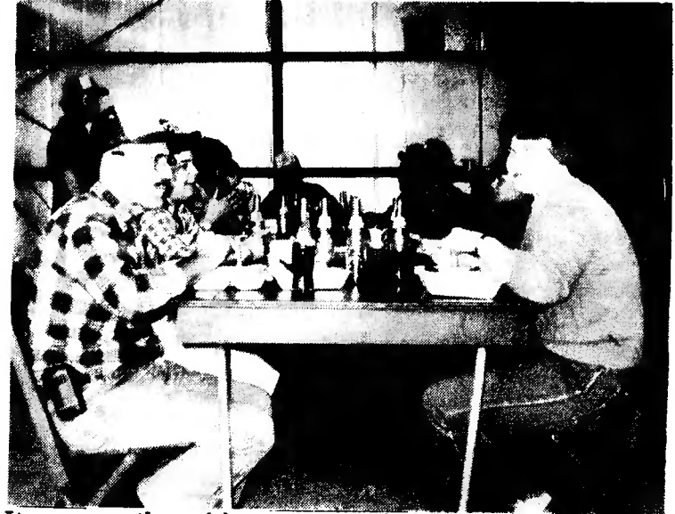
It was worth waiting to get to sit down and enjoy a good dinner. "Hey, when are you going to have another one of