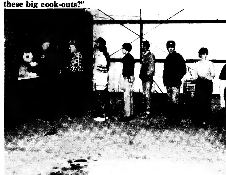
Customers lined up early to get a plate of barbequed chicken. They didn't seem to mind the short delay.