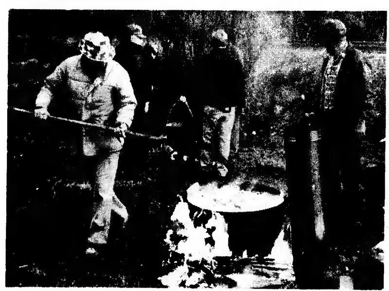
It takes many trips to the coal bed to keep all the pots cooking at a barbeque like Little Swift Creek's Affair last weekend.