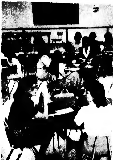
Patrons enjoy fashion show and luncheon