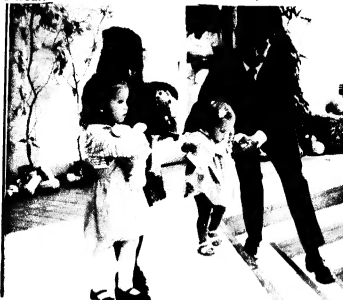
Senator Joe Thomas assists young ladies