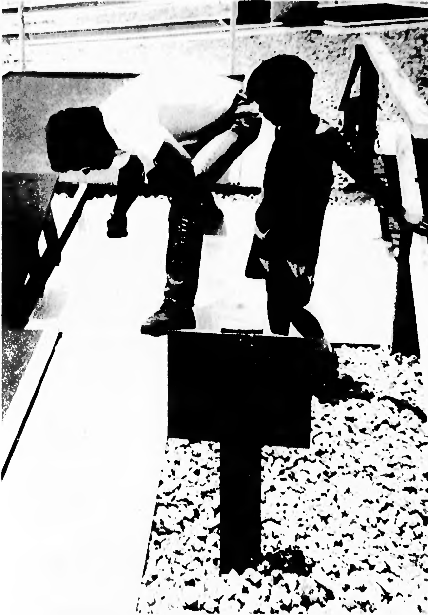
A penalty if the ball gets wet — and your shoes too.