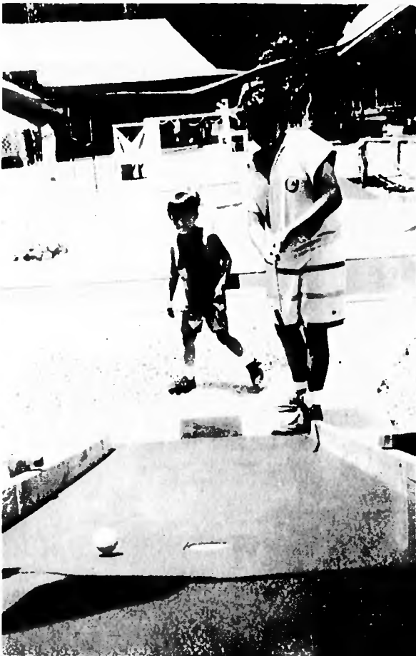
Up the hill and in the hole — maybe.

Forget the drivers, woods and irons. All you need is a putter and golf ball.