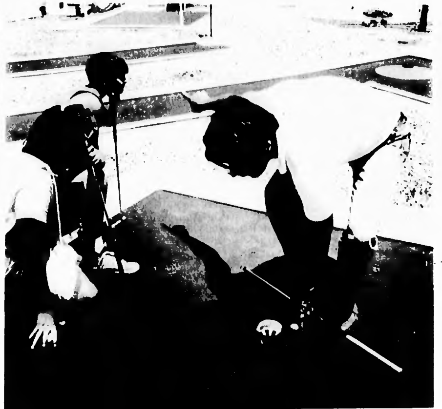
A little slight-of-hand helps any golfer — especially when no one looks.