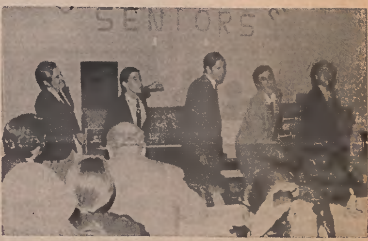
SENIORS "AT THE HOP" — Flash Cadillac and The Continental Kids entertain the juniors with some "oldies but goodies!"

from one end to the other. There were four winners to the best costumes — a Roller Derbiest, two Hersey Kisses, Little Bo Peep, an Arab, and a Scarecrow. They won pumpkins filled with Halloween treats. The evening celebrated the arrival of the Great Pumpkin (I hear he came this year) and St. Mary's observed this notable occasion in grand style.