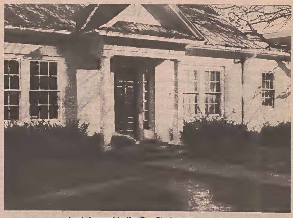
Look forward to the Day Student Dance in February!

After the chapel service, the Student Government Association lights the grove. While we have refreshments, a hired band will play. During this time, Raleigh neigh-