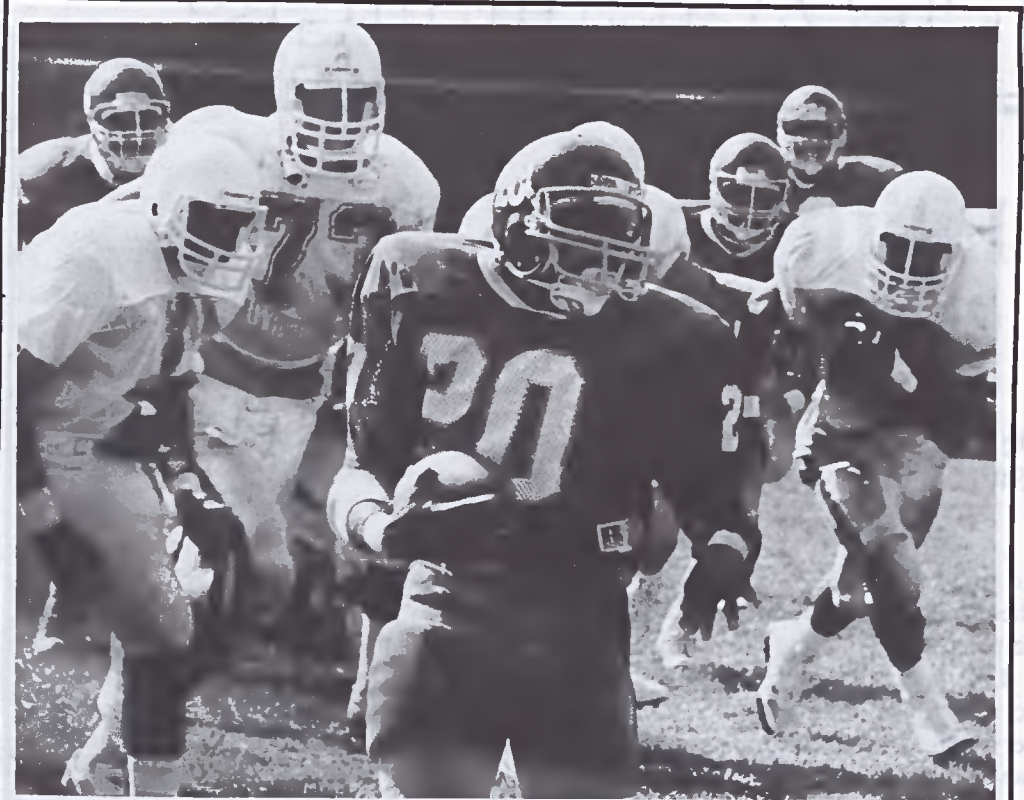
The Mars Hill Lions defeated Liberty Baptist in a 15-0 victory on September 13.