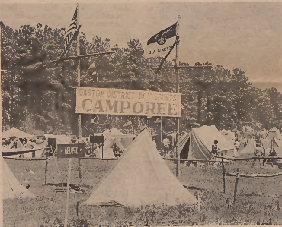
Camporee Headquarters at Belmont Abbey.