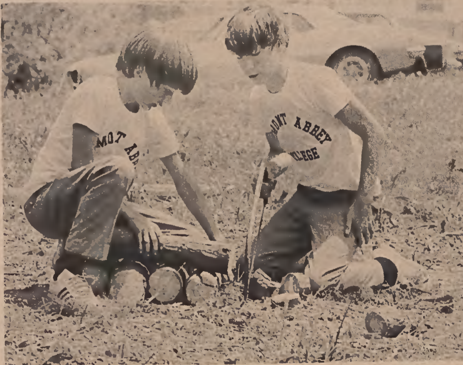
Scouts participate in the Bob Saw Relay.