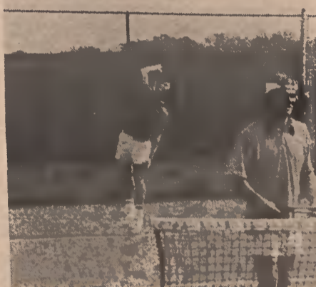
Tennis will be continued on a club basis.