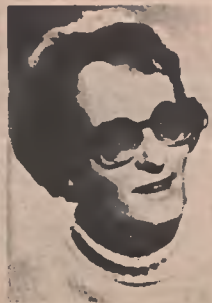
DR. ELISABETH KÜBLER-ROSS

... is a well known psychologist whose remarkable book On Death and Dying has helped many face, professionally and personally, the end of life with insight and understanding. She is the leading authority in this area in the United States today. Although she is Medical Director of the Family Service and Mental Health Center of South Cook County in Illinois she finds time to lecture to groups of doctors, nurses, ministers and educators across the country.