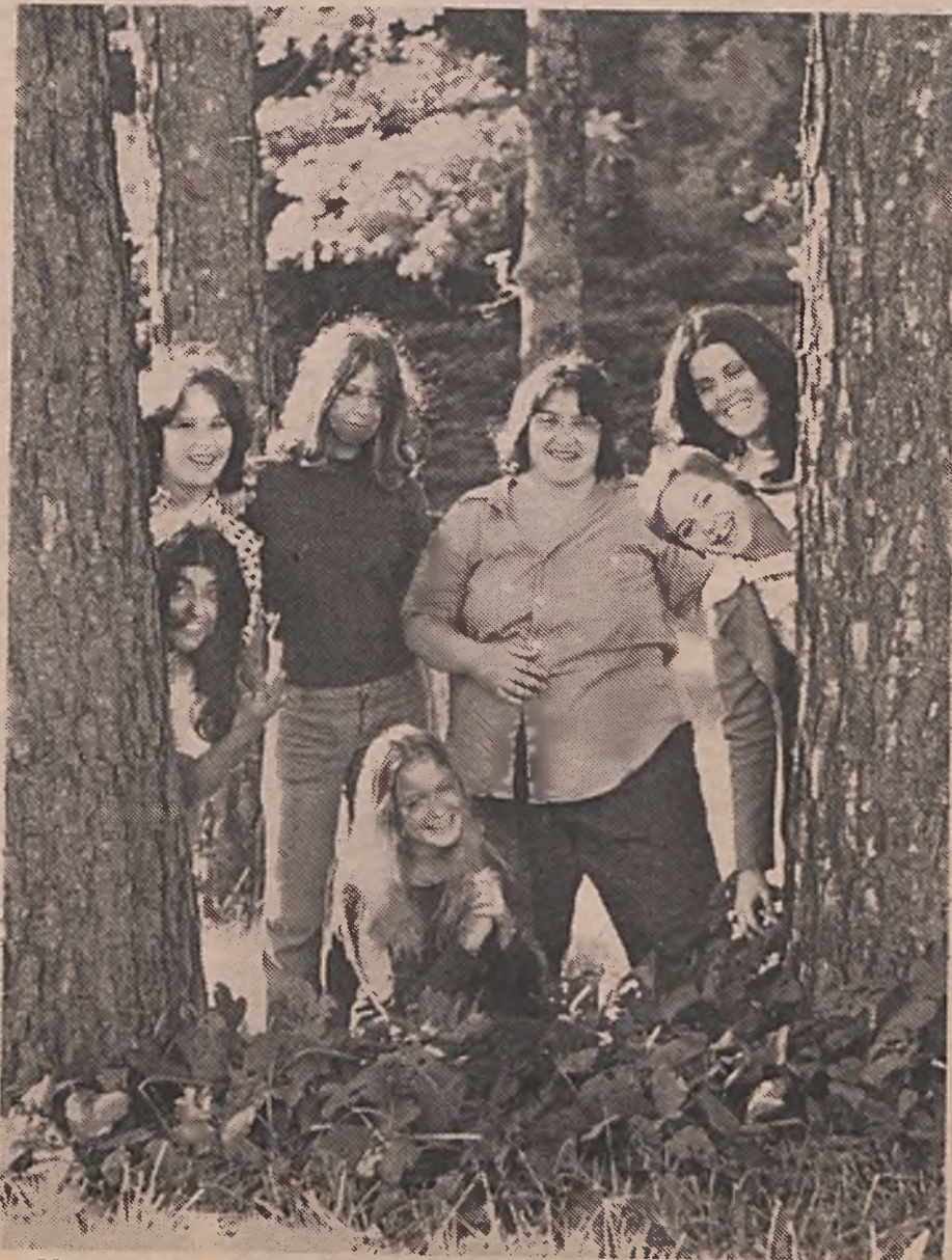
New on the Abbey Campus this year are the Abbey resident girl students. Captured in a moment of joy, these fair damsels are representative of the liberated happy Abbey lasses.