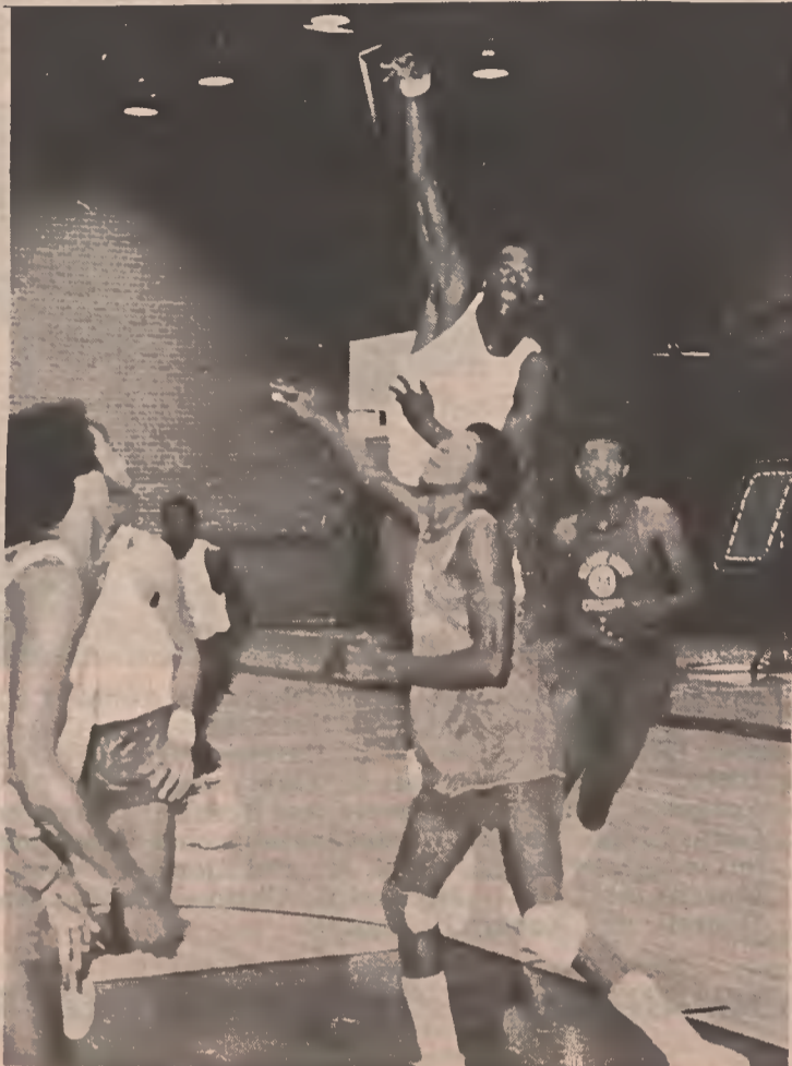
Crusaders get ready for tough season.