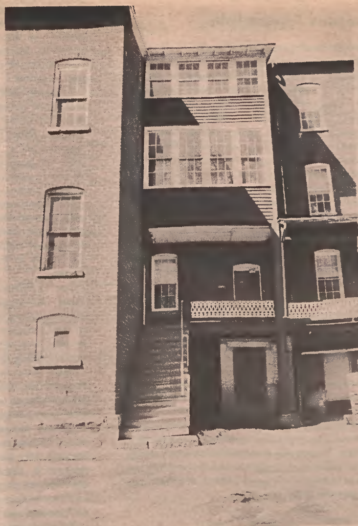
THESE WOODEN stairs have been replaced by a green metal spiral staircase.