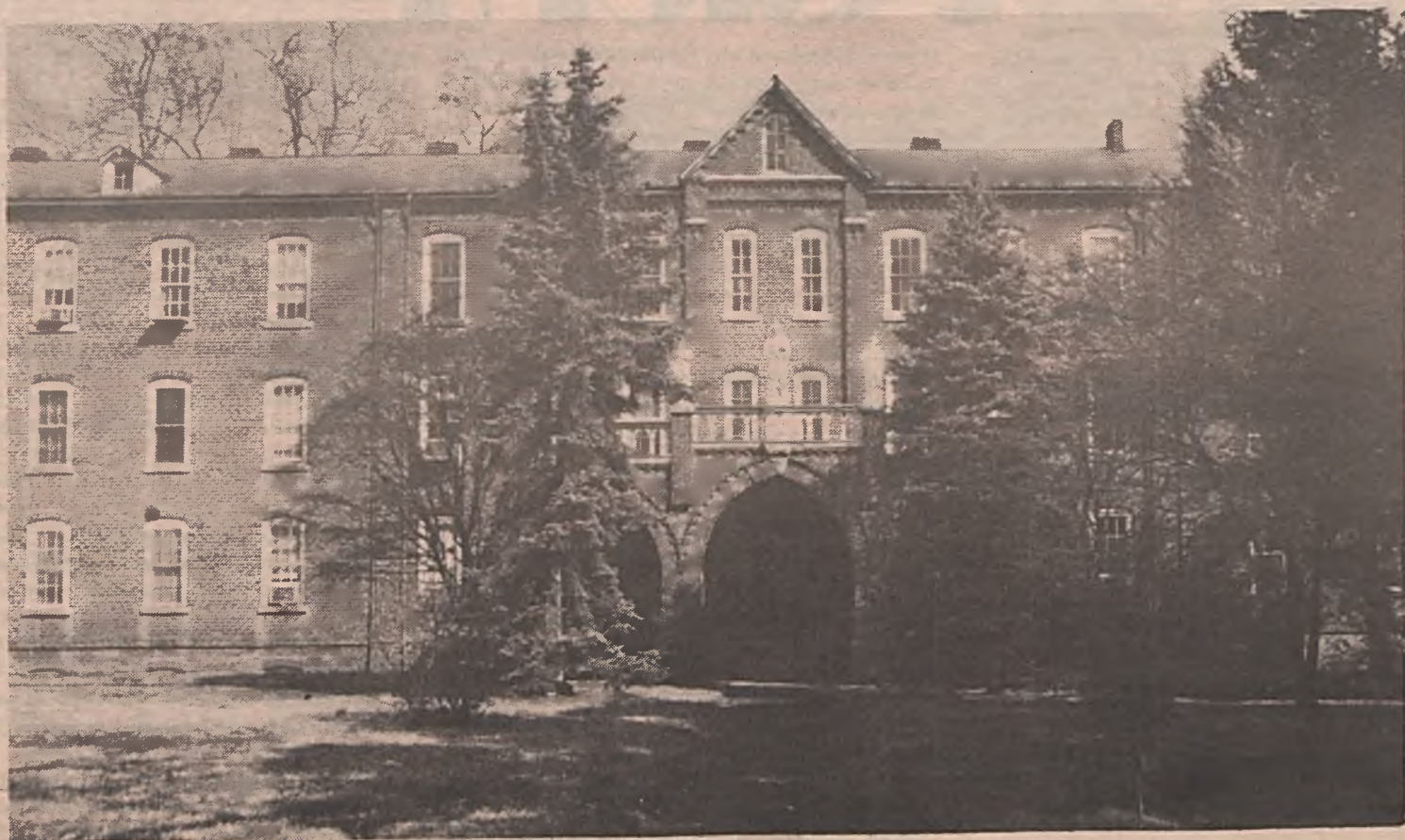
HERE IS A view of front entrance to the monastery before renovation. Compare this to photo on page 7.

Poorly heated in the winter, conditioned in the brutal, hot summer, suffering from lack of bathroom ventilation, local fire and health regulations, the 90 year old structure was in need of a renovation of the monastery's building.