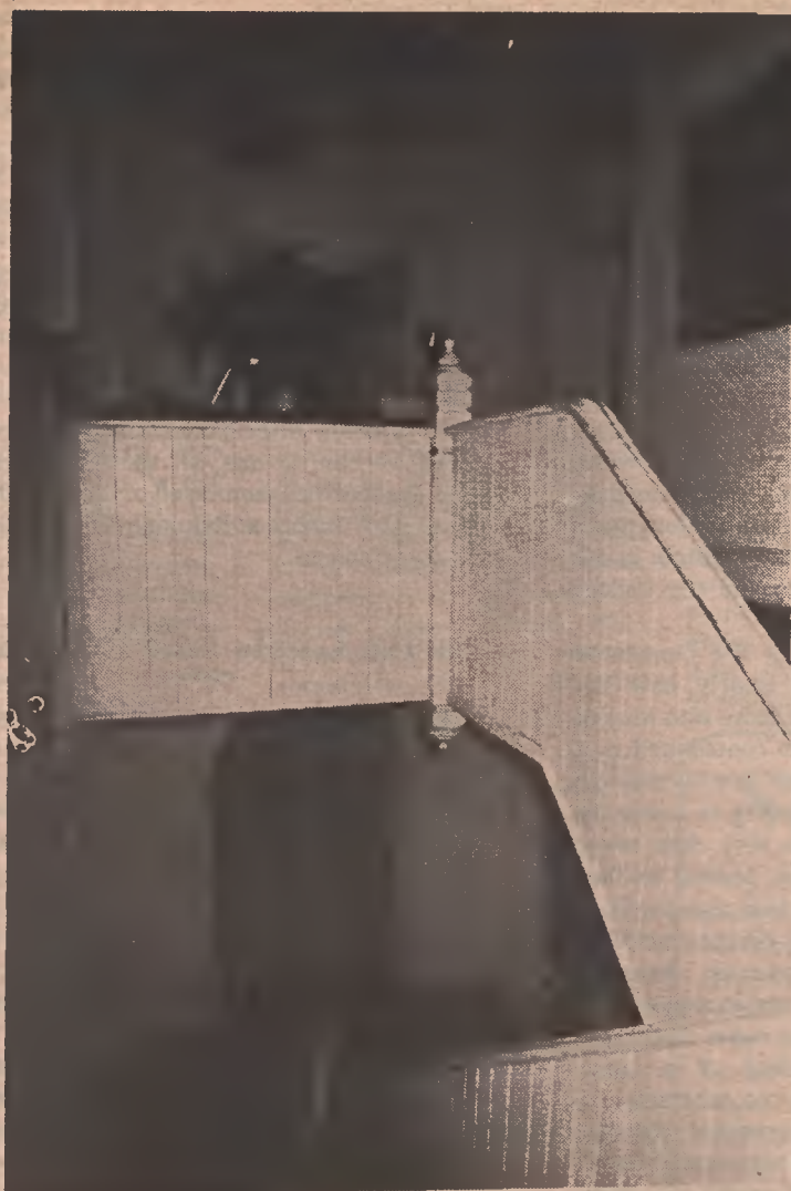
A BEFORE view of the old stairs going from the second floor to the third floor in the monastery.