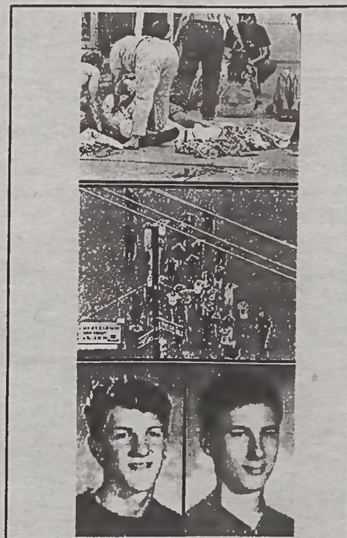
The Columbine High School massacre was the worst such tragedy in recent U.S. history.

in preventing shootings. Mediation allows for one to talk about problems with a peer, thus "letting off steam." Peer mediation and education of students are proactive approaches to the problem. However, parents' accountability would help to prevent the killing of others by children. If parent intervention was combined with "break-out" sessions at schools, then the problem of killing others would be drastically reduced.