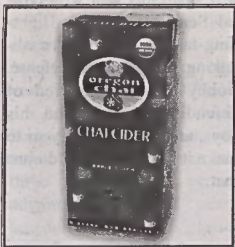
http://www.oregonchai.com There are many different kinds.

It's getting chilly out, and everybody likes stepping into a warm room and sipping something piping hot. A drink gaining popularity super quick is the chai latte, a wonderful spice milk tea from India. Some popular chai-serving shops include Francesca's Dessert Cafe and The Regulator on 9th Street, Mad Hatter's Bake Shop on West Main Street, as well as any Starbucks in existence. Many grocery stores sell pre-made chai latte mix and concentrates, such as Oregon Chai or Chaiwalla. For the truly daring, you can try brewing your own. You can buy chai teabags at Harris Teeter or Whole Foods. You'll also need milk, sugar, vanilla extract, and cinnamon/nutmeg (optional). Follow the directions on the box, and pour in some milk (not too much!). Add sugar and half a teaspoon of vanilla extract. Then add the spices to taste. How much of each ingredient you add is really all up to you. You can even head to the PFM and add some vanilla ice cream in place of the sugar and vanilla extract for a cool chai dessert!