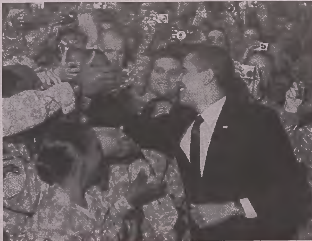
Obama announces withdrawal of troops from Iraq.

outside forces. Shia Iran and Sunni Saudi Arabia are both vying for more influence in significantly weakened Iraq. The implications of this conflict