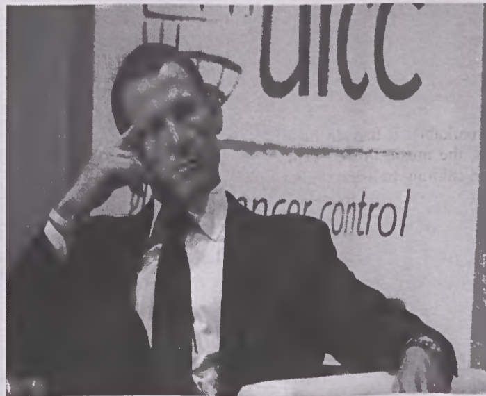
Lance Armstrong recently stepped down from his chair of the Livestrong Foundation

On Oct. 17, Lance Armstrong stepped down from