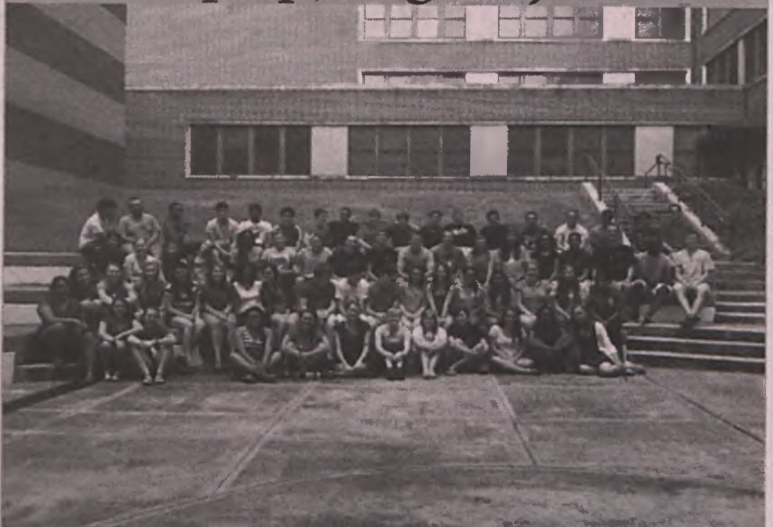
The 2013-2014 RLAs during the RLA training week