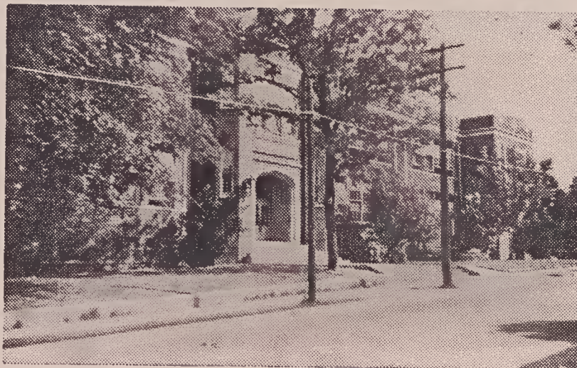
Lexington High School