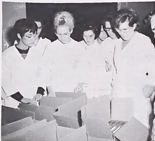
Forsythe Memorial Hospital technicians inspect the "Thrift-Paks" of film in Unreleased Finished Product Area.