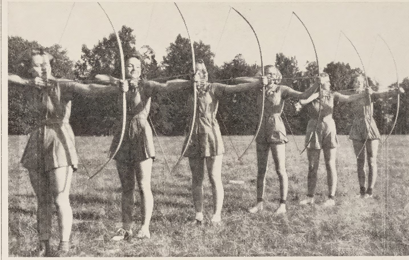
MEMBERS OF GIRLS ATHLETIC ASSOCIATION are shown above in one of their daily archery practices.