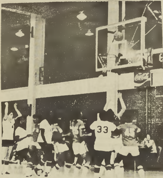
All eyes are on the ball during J.V. Girls game.