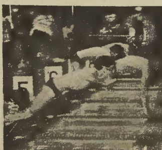
Swimmers off the blocks