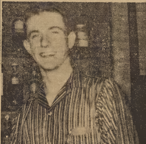
Way To Go, Boys . . . . .

Winners from the local area will go to the district fair at Wake Forest College, March 29, 1958. From there the winners will go to the State Fair at Duke Uni-