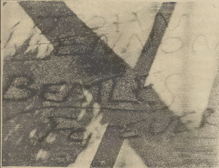
A fan of the late John Lennon vented his frustrations on the Grimsley breezeway recently with a can of black spray paint.