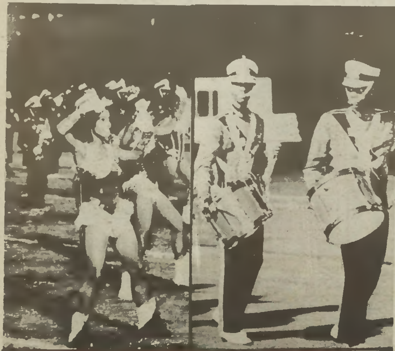
Hammer Please Don't Hurt 'Em