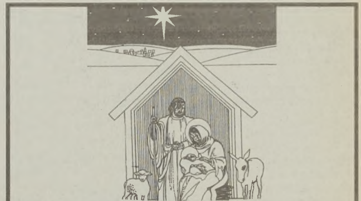
Away In A Manger

For reservations or information, call (336) 721-7352 weekdays. The MESDA Auditorium and The Toy Museum at Old Salem are both located in the Frank L. Horton Museum Center, 924 South Main Street at the lower end of the Old Salem historic district.