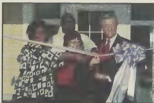
Photo Taken during Grand Opening of center