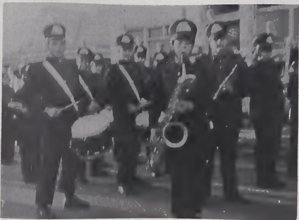
In spite of peas, cigarettes, and other hindrances the band played on in the Christmas parade. Here they stop to pose for our Spectator photographer.