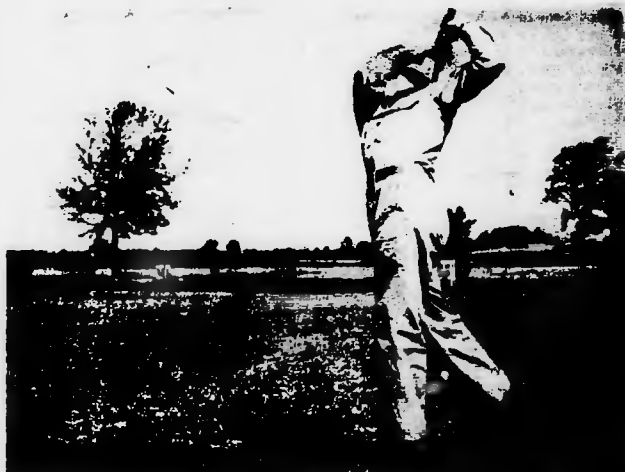
The cameraman caught this golfer in a stylish follow through while playing at the Goldsboro Golf Course available to GIs.