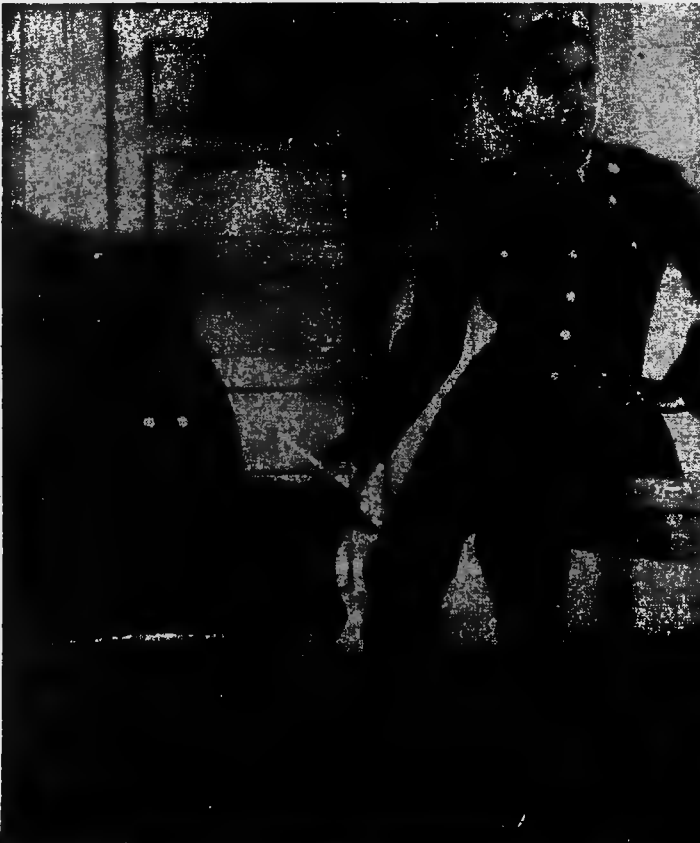
Lucky, lucky boy! He's modeling the ultra-modish Olive Drab Dress Uniform. Observe the clean, wedge-shaped cut of the jacket—the flattering drape of its lines. Style authorities condone its wearing of the khaki shirt with this ensemble, definitely the smart thing this year. Obviously designed for carefree dates and joyous hours of pleasure, the OD uniform marks a new height in