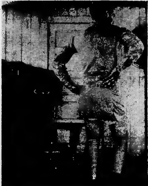
The Army Khaki Shirt, realization of every fashion-tailor's dream, shows chic and verve in every line. Note the swoop of the lines, the finely cut, exquisitely contrived insweep of the lateral seams. This form-fitting creation is specially designed for the 18 to 38 year-olds but anyone with a lucky enough figure may enjoy wearing it.