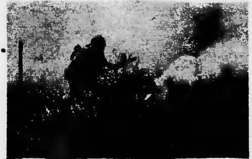
Completely demoralized by sniping from positions he cannot see and grenades thrown from invisible positions, this enemy soldier loses his head. Whether he intends to surrender or not, he's a perfect shot.