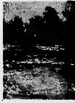
Ducking and weaving, an attack. Foxholes in foreground have been prepared with detonation flares. This has kept location of most