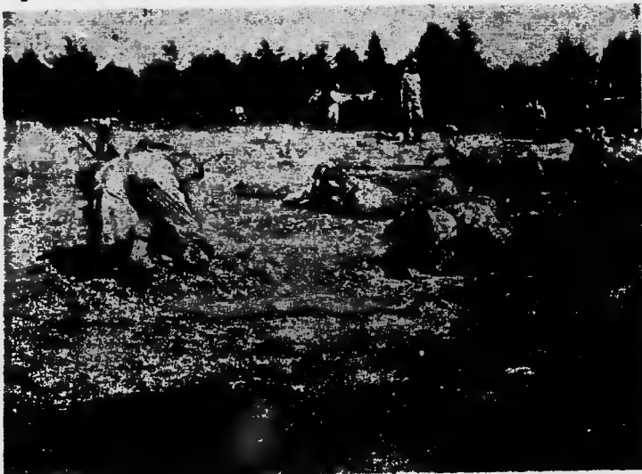
There's an enemy paratrooper who'll never feel like sitting down anymore! Under ruderous fire from machine-guns, he's forgotten one of the basic facts of camouflage—Keep Your Tail Down. Soldier to his right uses the "cat crawl" moving on his hands and knees. The frenzy of the assault and the vigor of the defense has left them no time to dig in for cover.