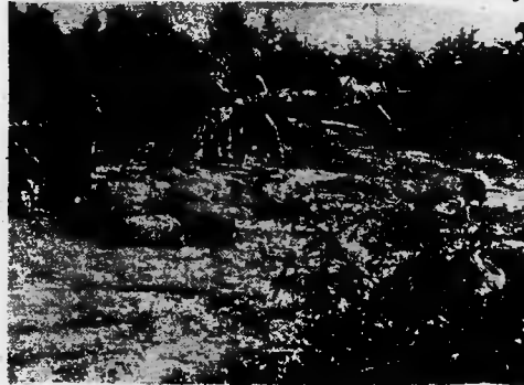
Mobile reserves move into prepared sandbag defenses or crouch in field trenches and foxholes. They are ready at any time to leave their posts in order to attack or withstand an assault in some other sector.