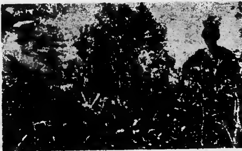
Here, snipers, dressed in camouflage uniforms of mottled brown and green with burlap ribbons confusing their outlines, are directed into hiding. They take positions covering the assault of the enemy troops.