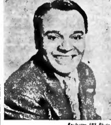
Lucky Millinder and his Orchestra are the headline attraction in Los Angeles, Calif.