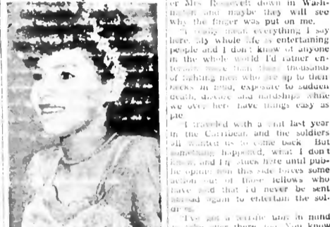
Philippa Schuyler, 13-year-old concert pianist, appeals for support of the March of Dimes in celebration of the President's birthday. Miss Schuyler contributed one month's allowance to the March of Dimes. She is the daughter of Mr. and Mrs. George Schuyler of New York City. Her father is the well-known author, columnist, and lecturer.

NEW YORK—There has been an alarming rise in the epidemic of infantile paralysis in America. Last year was the worst but one in the eight history of polio. It is fearfully democratic, striking rich and poor, black and white alike. None of us can conquer it alone. We can only hope to overcome it by the help of others. Now, how can we insure the help of others? When a member of a large family becomes ill, all of them pitch in and help. That is what a family is for. Mutual aid and comfort. A nation must do the something but on a larger scale. Since children are the worst sufferers in this dreaded disease, they would like some positive way to help fight it. They can't be doctors or nurses and they haven't money—so what can they do?