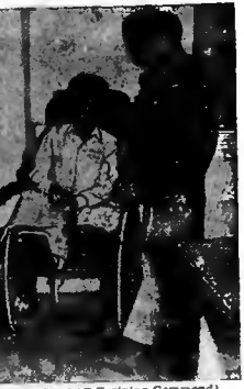
NEW YORK — The 1945 Fund-Raising Appeal of The National Foundation for Infantile Paralysis in Celebration of the President's birthday will be opened officially throughout the nation Sunday night, January 14, by Basil O'Connor, president of the National Foundation, in a coast-to-coast broadcast over a national network of radio stations.

The Appeal will continue through January 31 and is the 12th annual campaign in the war against infantile paralysis. Throughout the nation, millions of workers are participating in an intensive campaign.