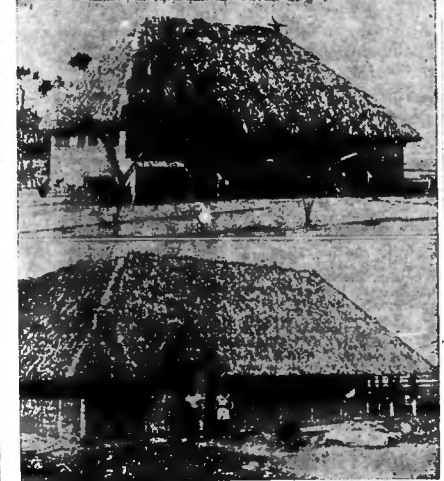
Build by natives from native materials are the commanding officer's residence (top photo) and the new mess hall (below) at the U. S. Marine station in the Marshall Islands. Timber is taken from scrub trees; roofs and walls are thatched in the true native style. The building projects provide a livelihood for the impoverished native population, whose fishing boats and equipment were destroyed during the American assault to capture the Marshalls.