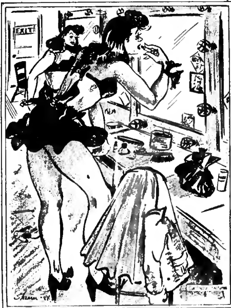
"Some times I wonder if they realize the job we're doing on the boys morale."