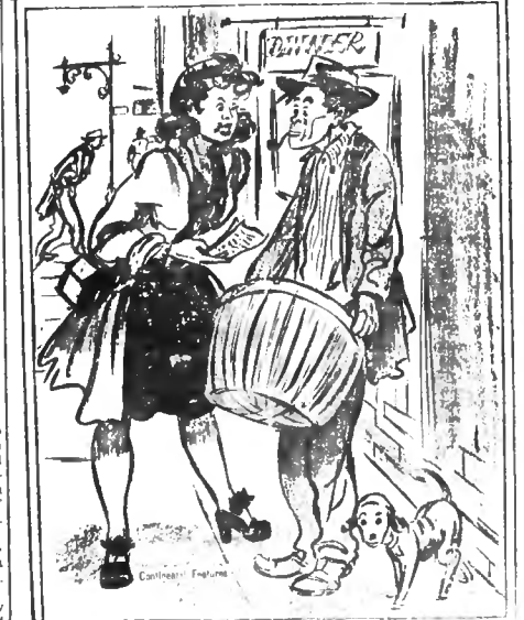
NEXT DOOR: — But Pop, — what does he want with silk stockings in a Foxhole —!