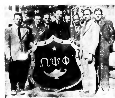
Meeting in Charlotte, recently were these members of the 8th district council, Omega Psi Phi fraternity who discussed the district organization and laid tentative plans for the annual meeting in December.