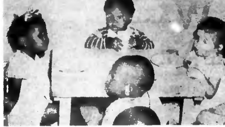
Children of working mothers eat their lunch in the nursery school of Council House, a community center in the East Bronx, New York...